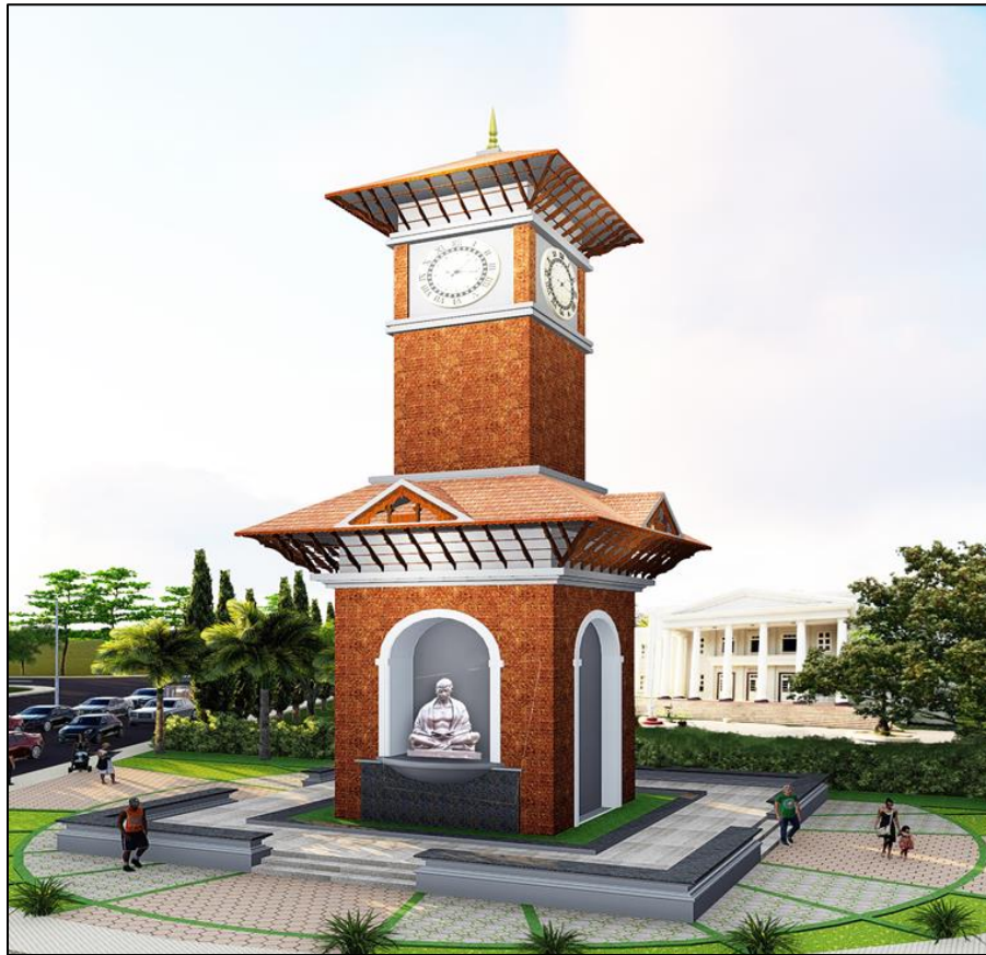
Figure 3: Proposed Clock Tower Design