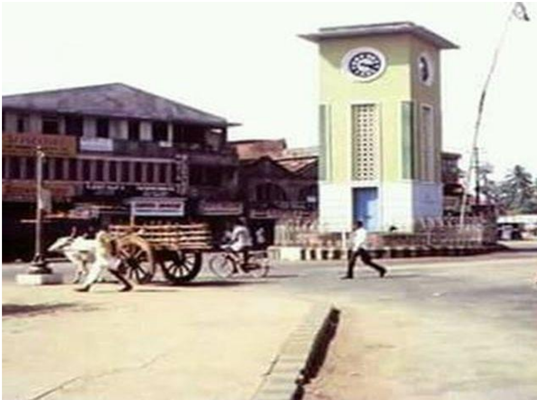
Figure 2: Old Clock Tower

A clock tower was existing near to the Town hall, Mangaluru. The location is called as “Clock Tower Junction” because of the existence of Clock Tower. The Clock Tower demolished in 1994 by Mangaluru City Corporation during road widening. The clock tower was the gift of M Vaman, proprietor of Vaman Nayak and Sons - manufacturers of mechanical clocks - to the city in 1968, who built it by raising funds from businessmen. The 45-foot high structure had a dial with a circumference of six feet and was made using casting process. The structure was maintained by the Vaman Nayak and Sons for 26 years until it was demolished for road widening in 1994.